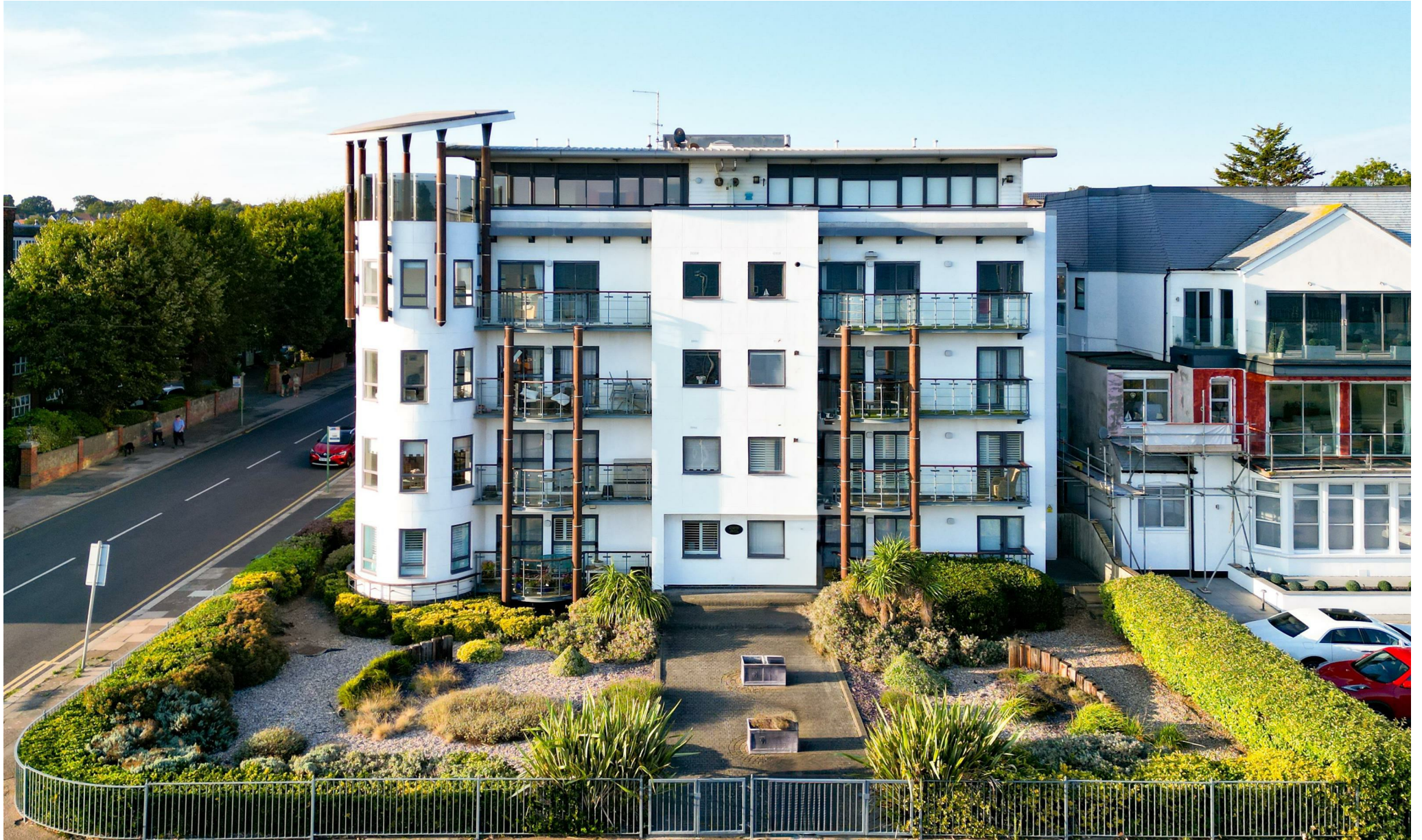
Crowstone Avenue, Hamilton Grange £750,000