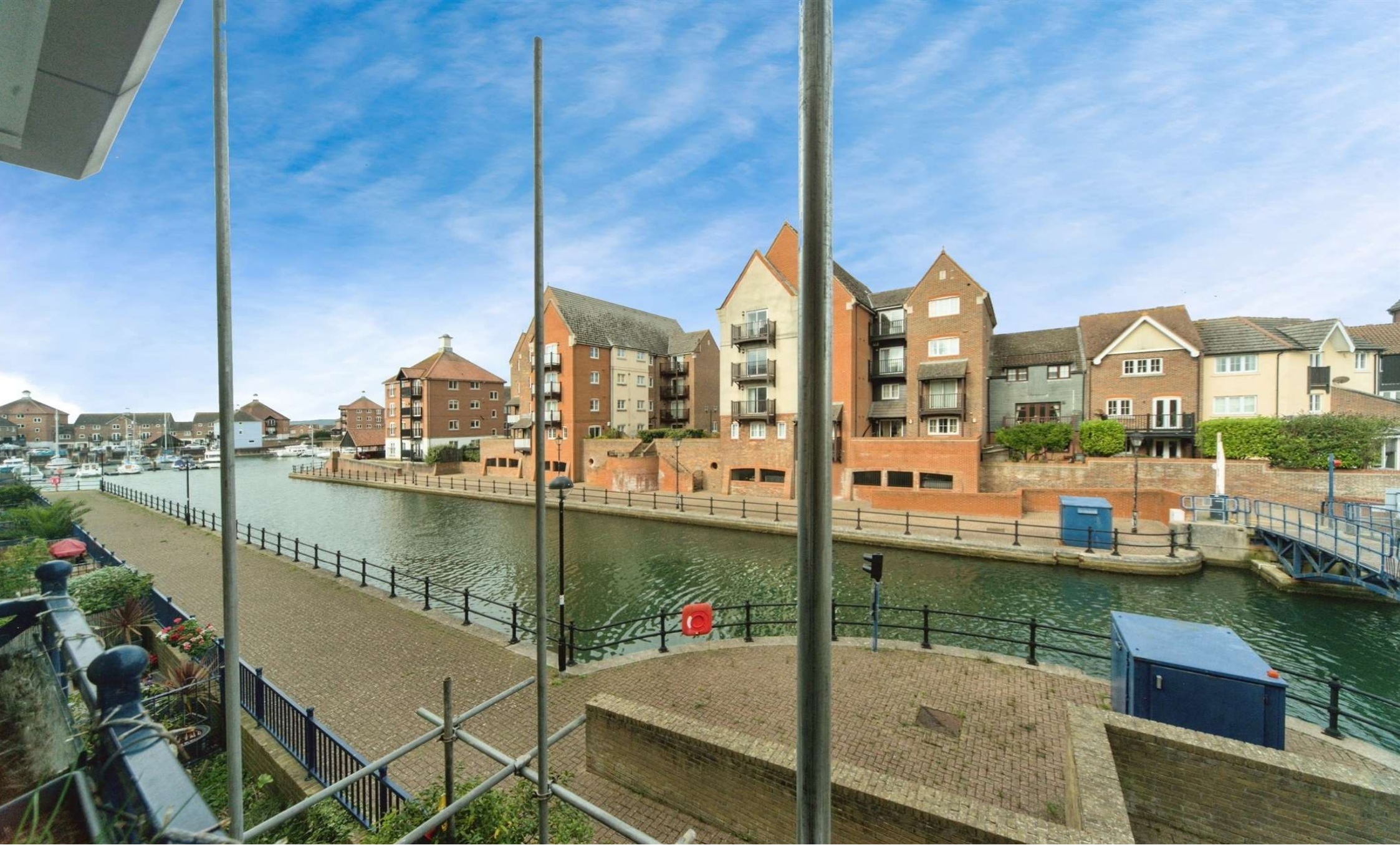
The Piazza, Eastbourne BN23 5TG