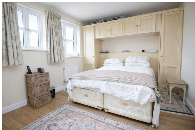
Bedroom One 15'7 x 10'0 (4.75m x 3.05m)