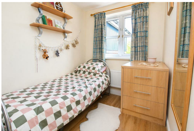
Bedroom Four 9'9 x 6'7 (2.97m x 2.01m)