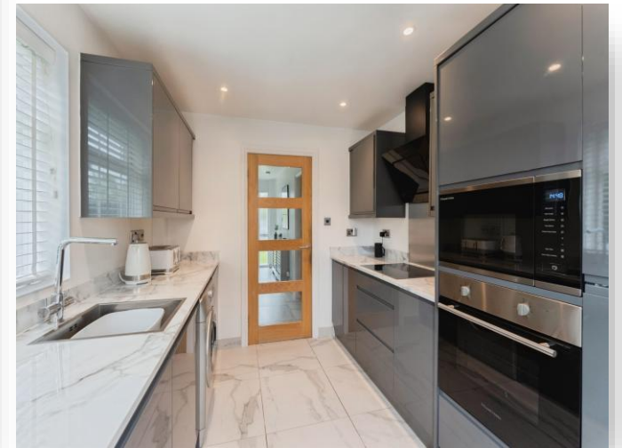
Budworth Road, Great Sutton Ellesmere Port CH66 2RJ