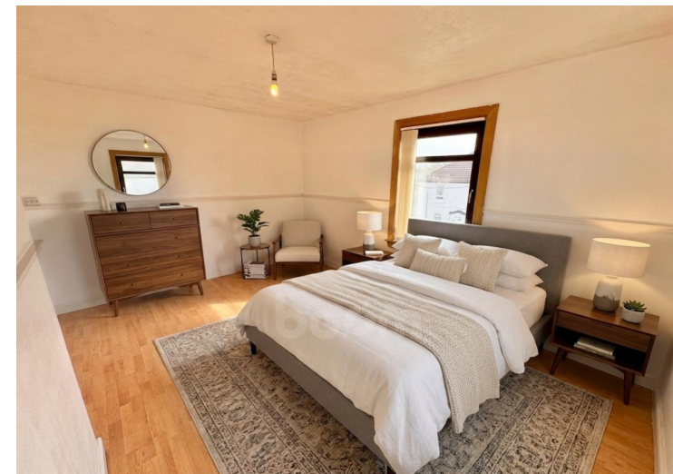
Ladyford Avenue, Kilwinning