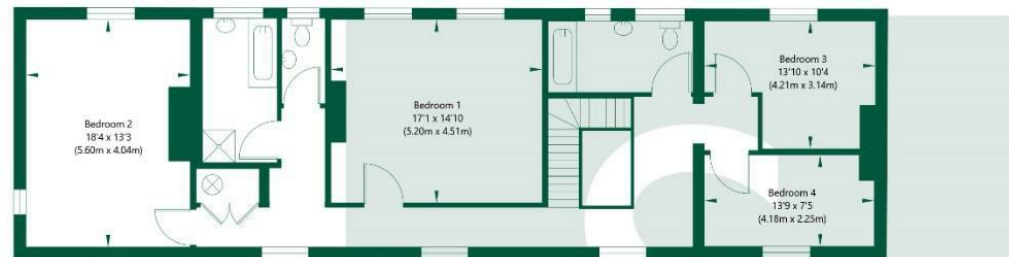
First Floor GROSS INTERNAL FLOOR AREA APPROX. 1255 SQ FT / 116.61 SQ M