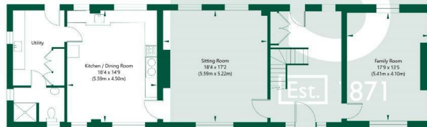
Ground Floor GROSS INTERNAL FLOOR AREA APPROX. 1239 SQ FT / 115.12 SQ M