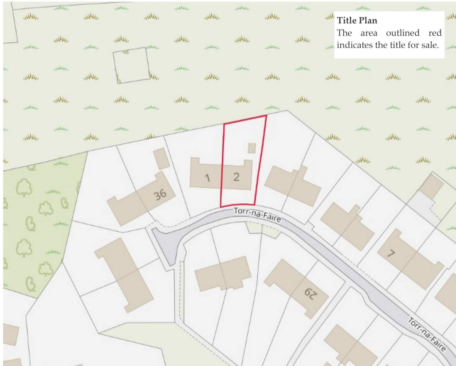
Title Plan The area outlined red indicates the title for sale.