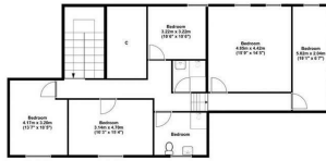
First Floor Approx 138.00 Sq metres (1485.00 Sq Feet)