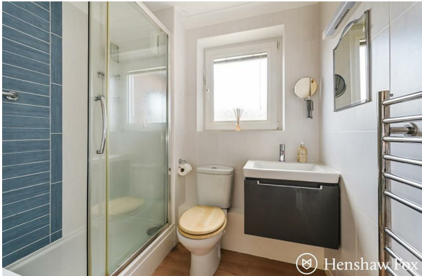
17 Homestead House | £120,000 Middlebridge Street, Romsey, Hampshire, SO51 8QL