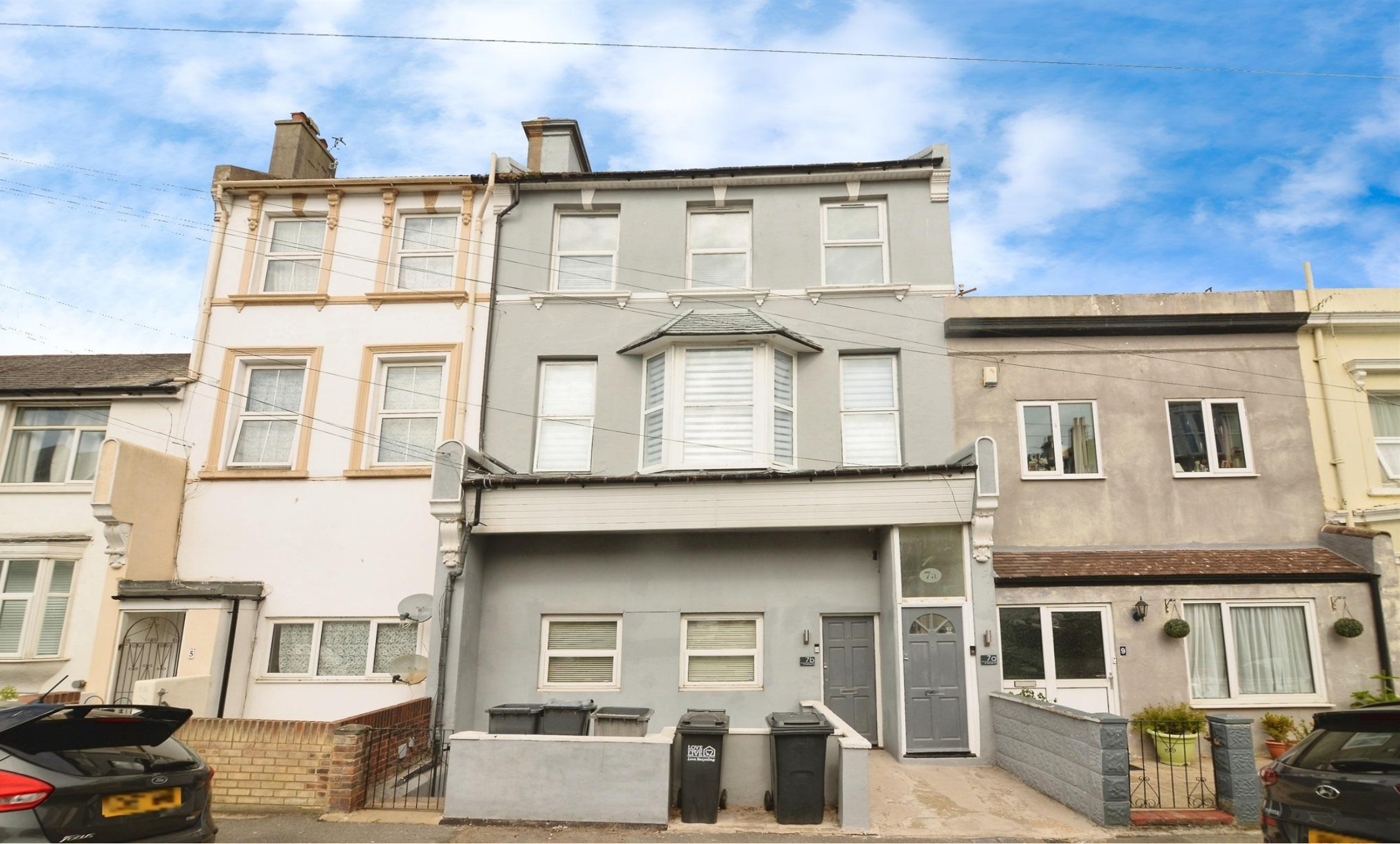
St. Georges Road, Hastings TN34 3NH