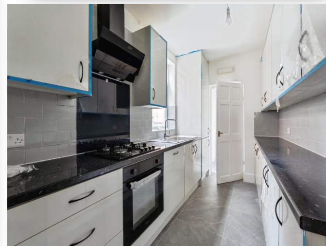
Browning Street, Leicester LE3 0JL