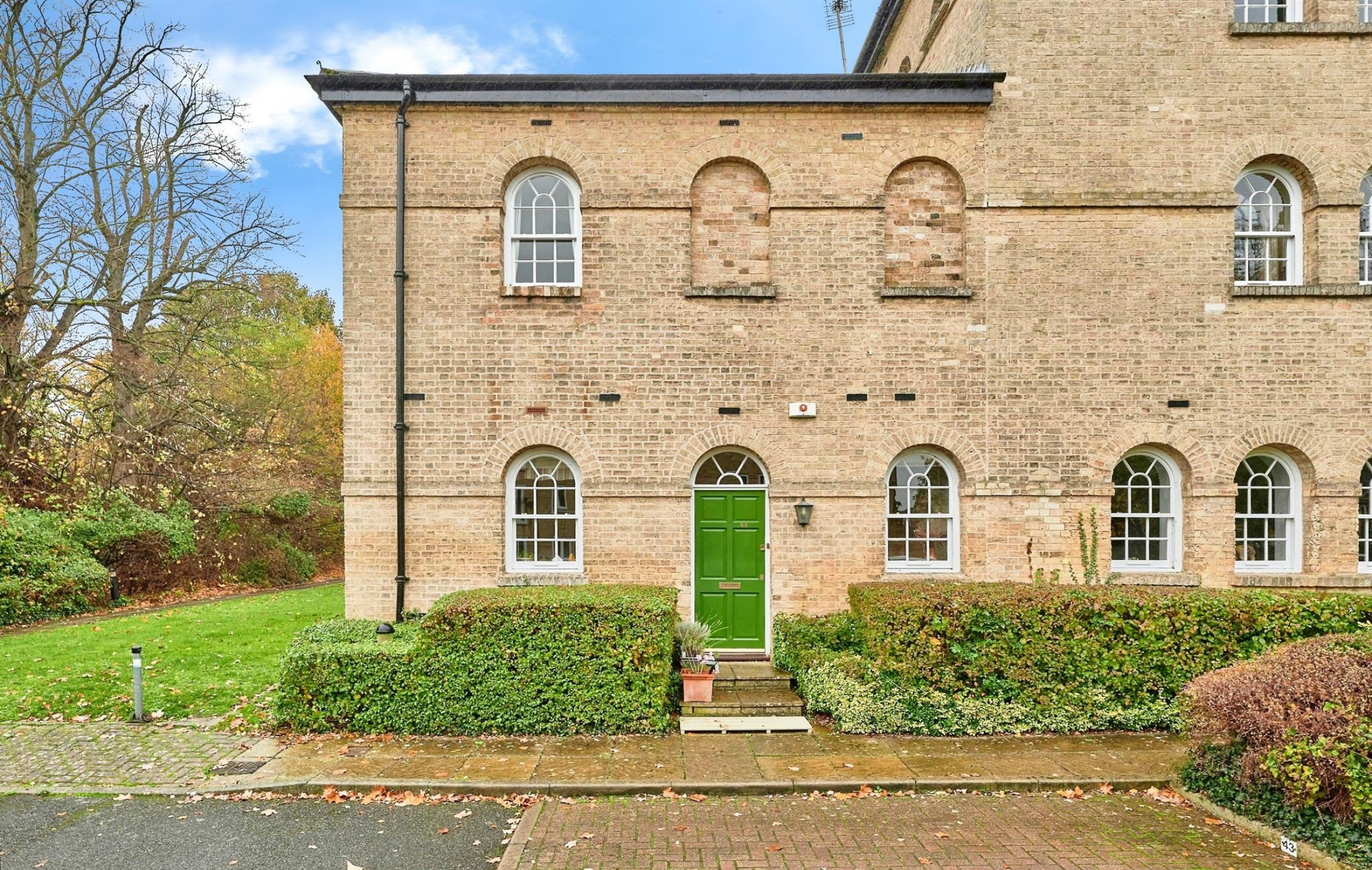
The Spike, Radwinter Road, Saffron Walden OIRO £350,000 Leasehold