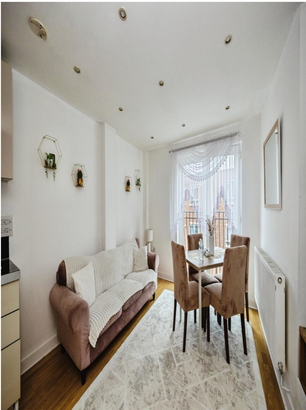
Elm Grove, Southsea PO5 1JF