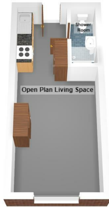
Fleet Street, Leicester, LE1 3AZ

All measurements are approximate and for display purposes only