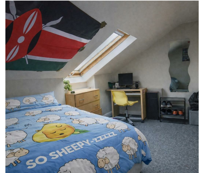
Merthyr Street, Cathays