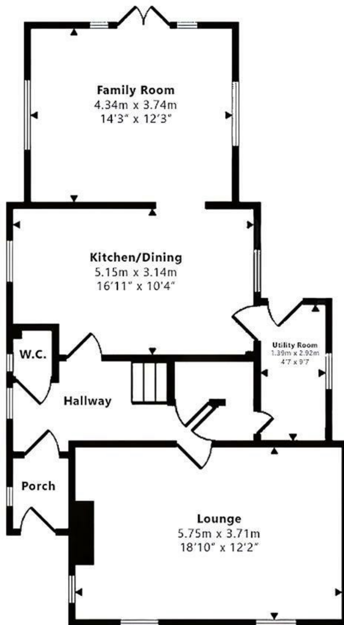
Ground Floor 72sqm/777sqft approx.