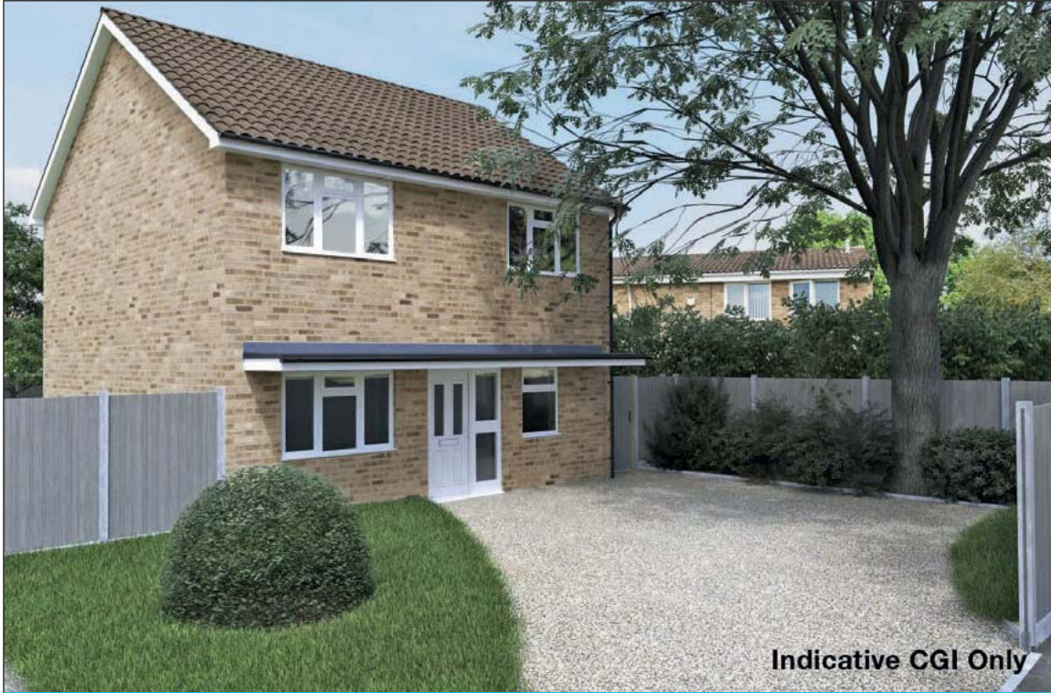
All enquiries Ref: Callum Glenn