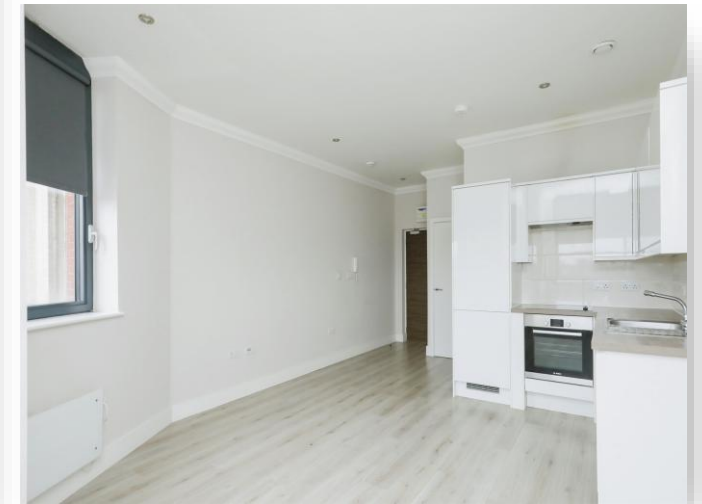
Sentinel House, Surrey Street, Norwich, NR1 3SZ