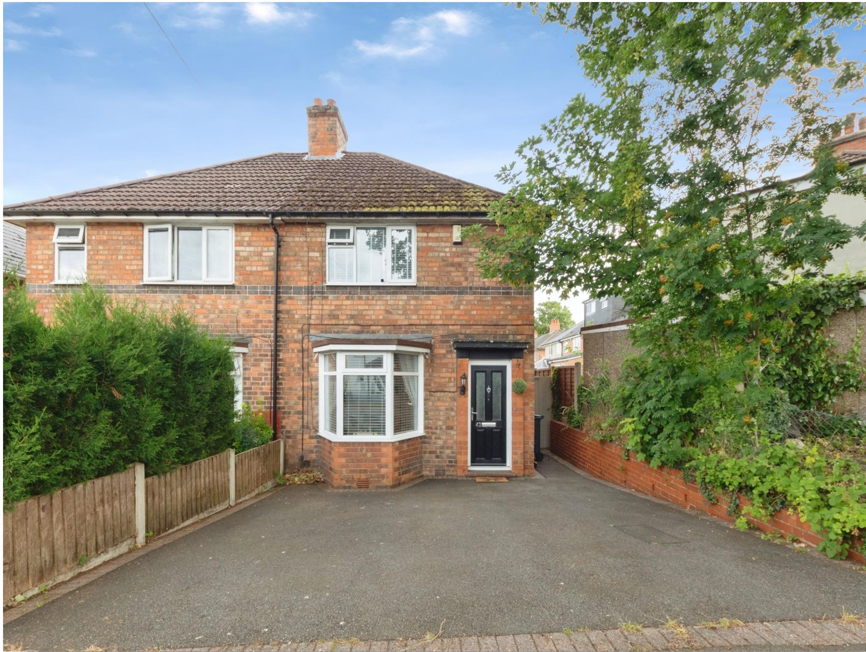
Ravenshill Road, BIRMINGHAM B14 4HL