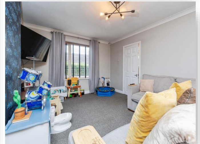
Kinross Grove, Hartlepool TS25 3NN