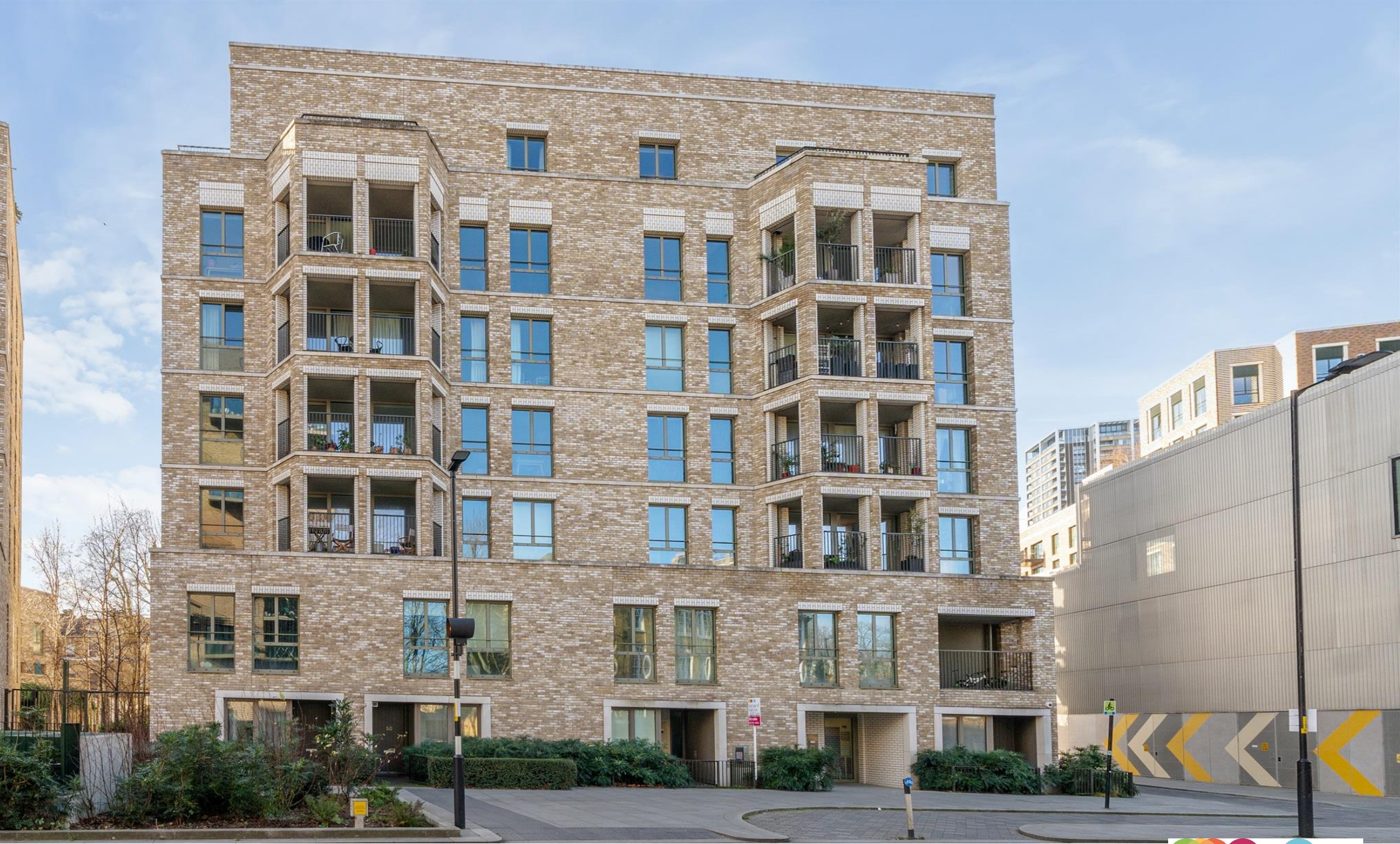
Arum House Rodney Road, London SE17