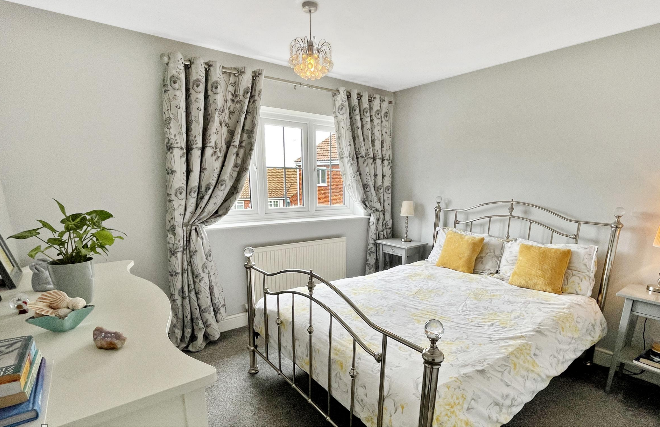
Gainsborough Close, West Mersea, Colchester, CO5 8PR