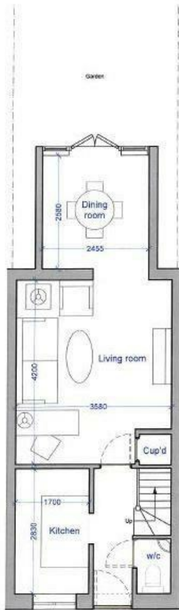
GROUND FLOOR PLAN SCALE 1:50