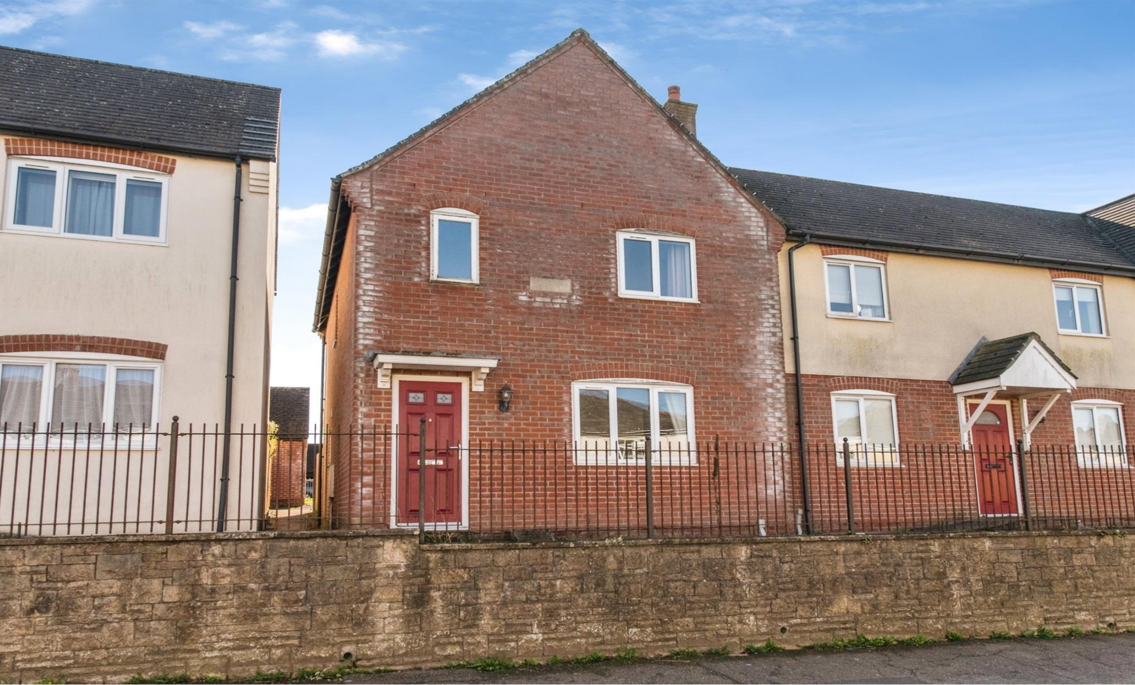
Eldridge House, Chard Road, Axminster EX13 5GB