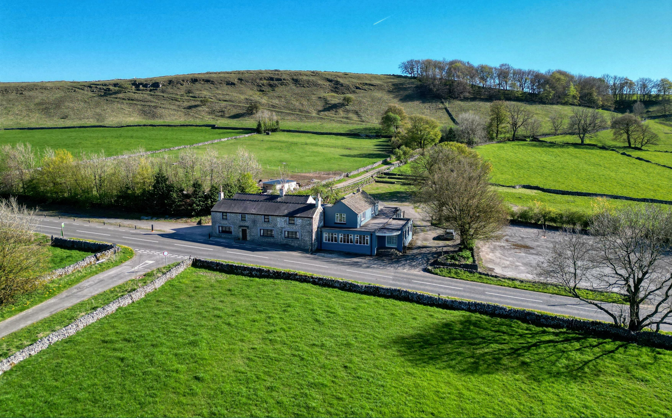
Waterloo Hotel Taddington, Buxton, Derbyshire, SK17 9TJ