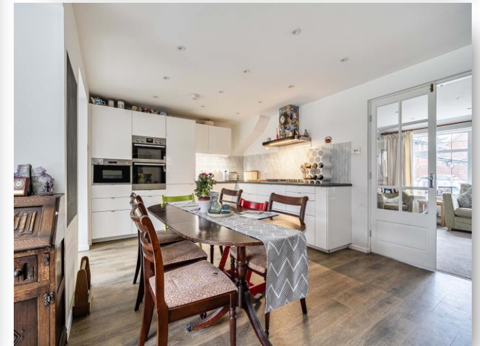
30 Great Hill Crescent, Maidenhead SL6 4RF