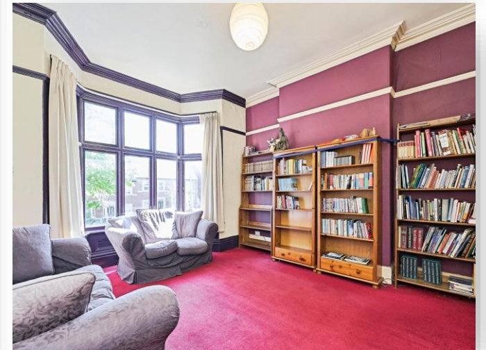
Little Moor Hill, SMETHWICK B67 7BG