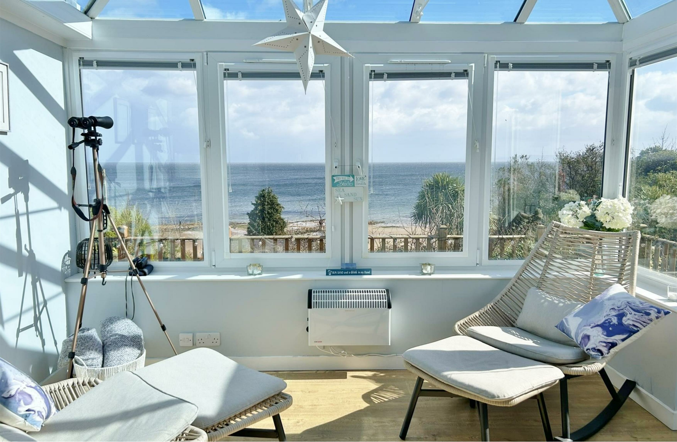
Mingulay Whiting Bay, Isle Of Arran, KA27 8QH