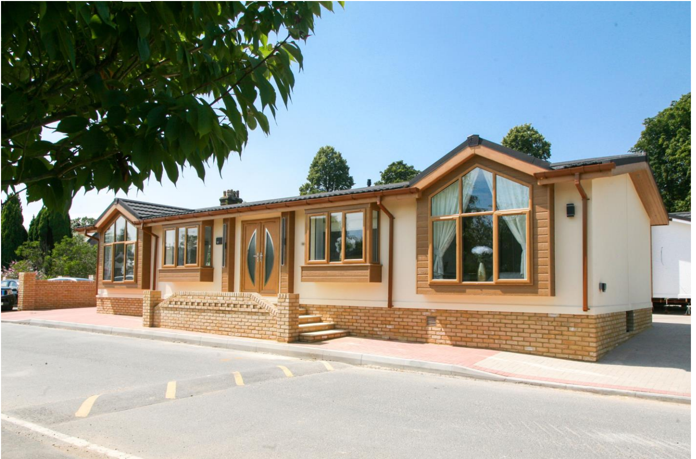
11 Nightingale Rise Weybridge Park Estate Addlestone Surrey KT15 2RF