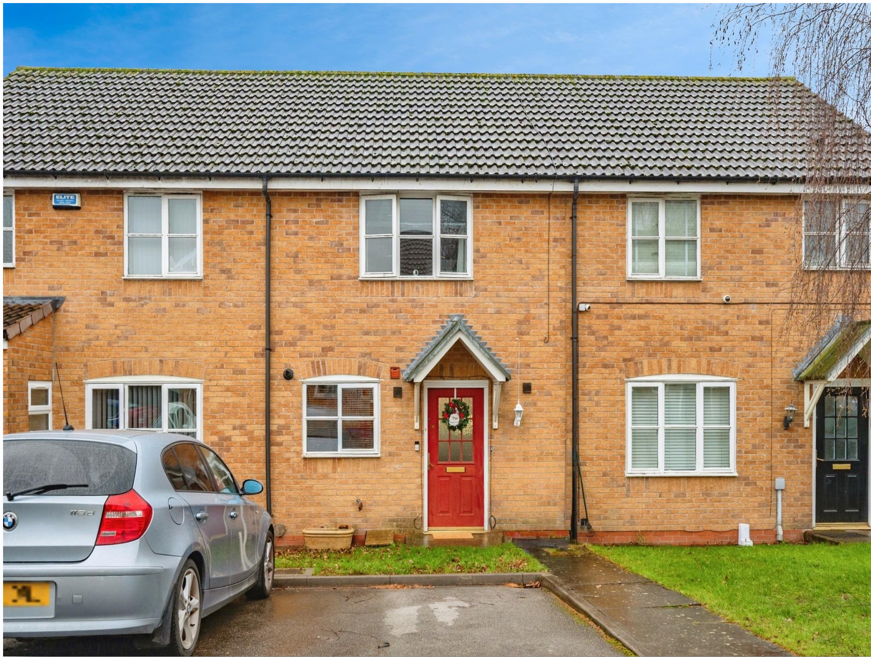
Grosvenor Drive, Littleover Derby DE23 3UQ