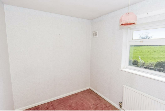
UPVC double-glazed window to rear with country views. Built in wardrobe. Radiator.