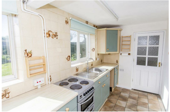
Utility Room 8'0" x 7'11" (2.44m x 2.41m)