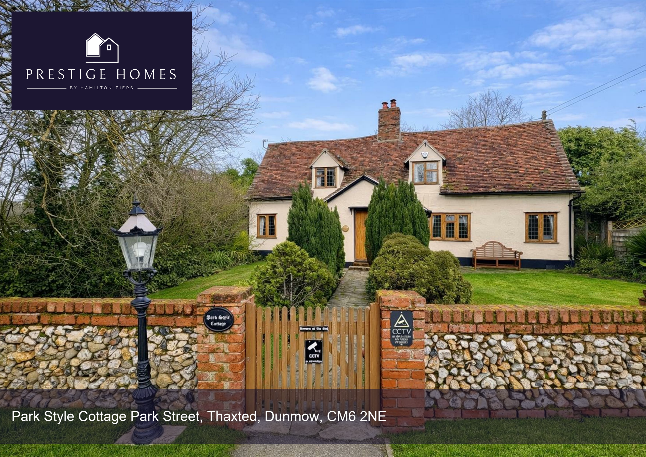
Park Style Cottage Park Street, Thaxted, Dunmow, CM6 2NE