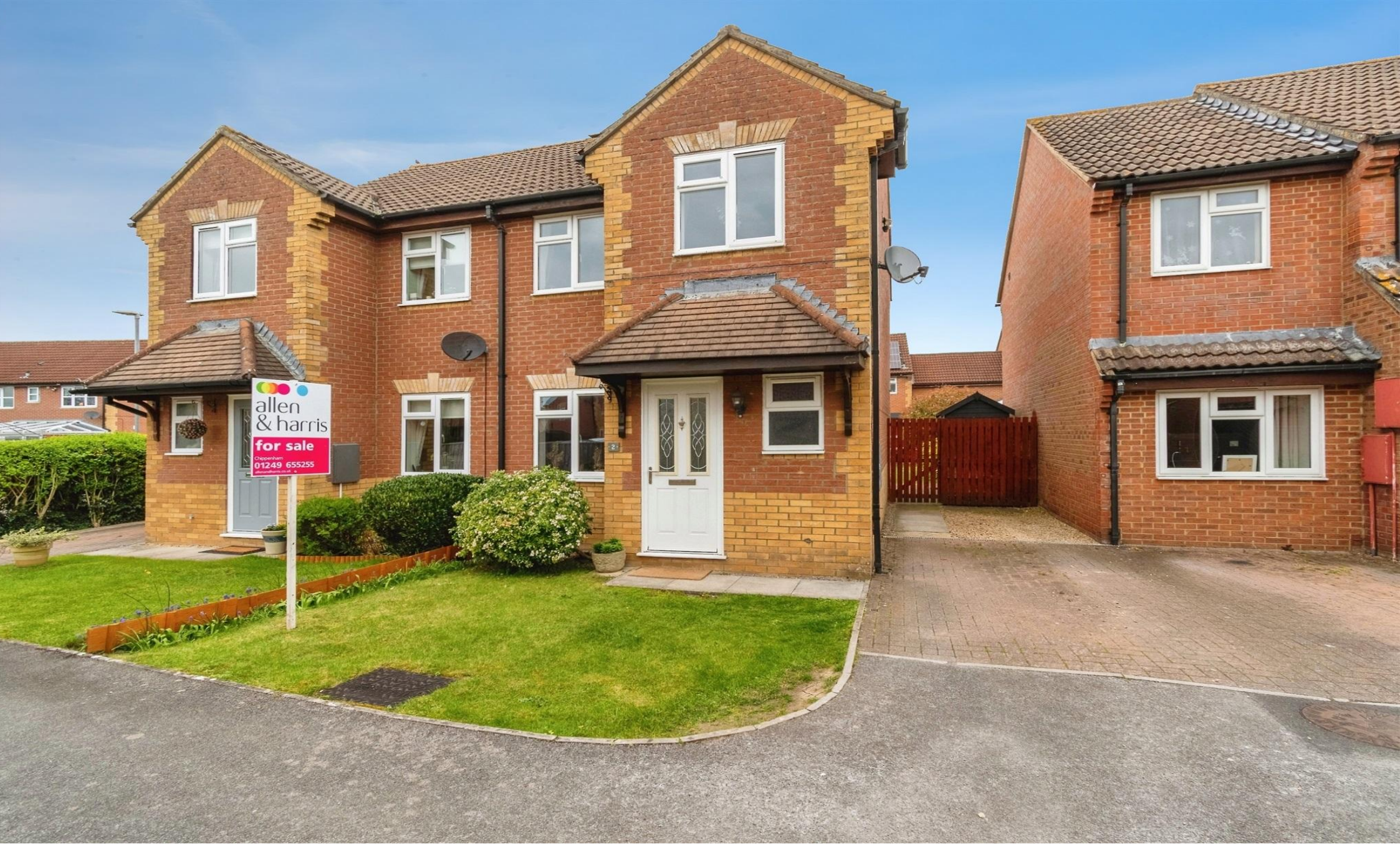
Foxglove Close, Melksham, SN12 6FS