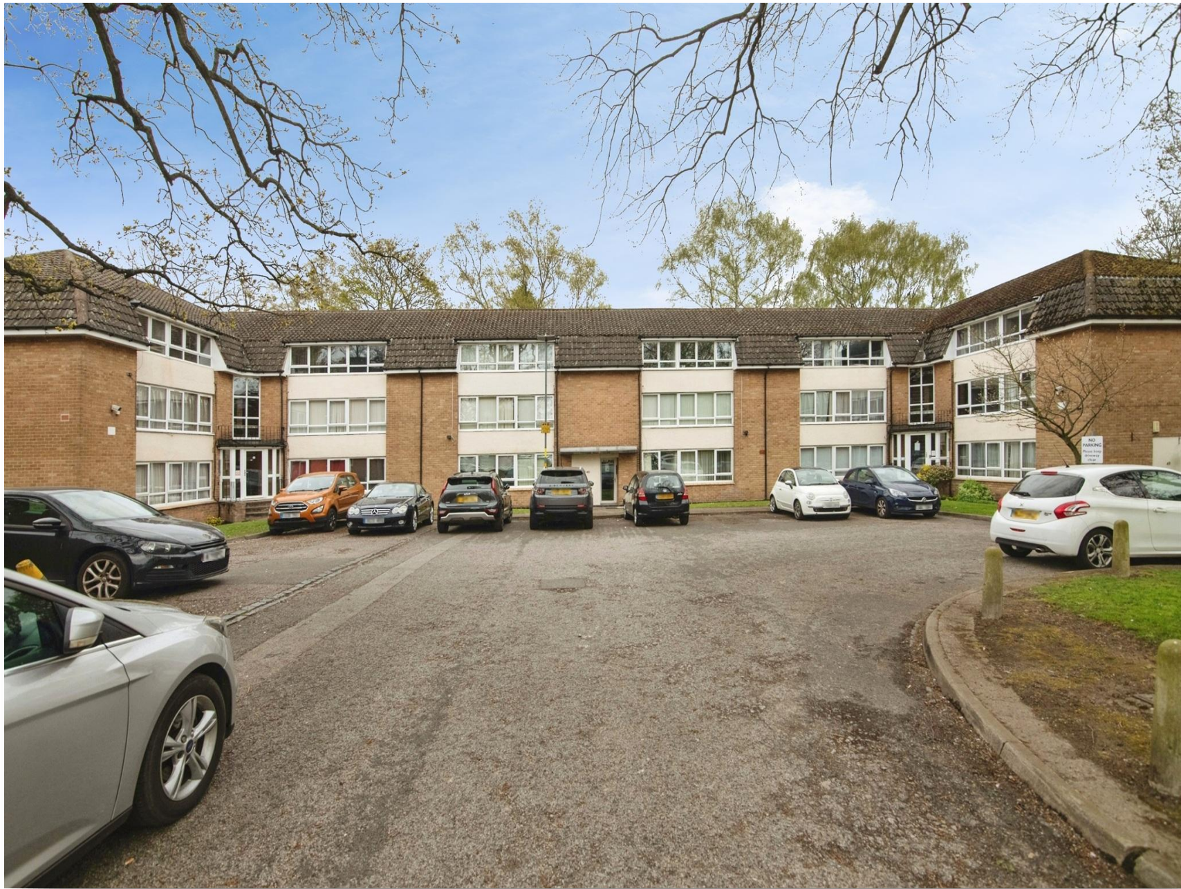
Limberlost Close, Birmingham B20 2NU