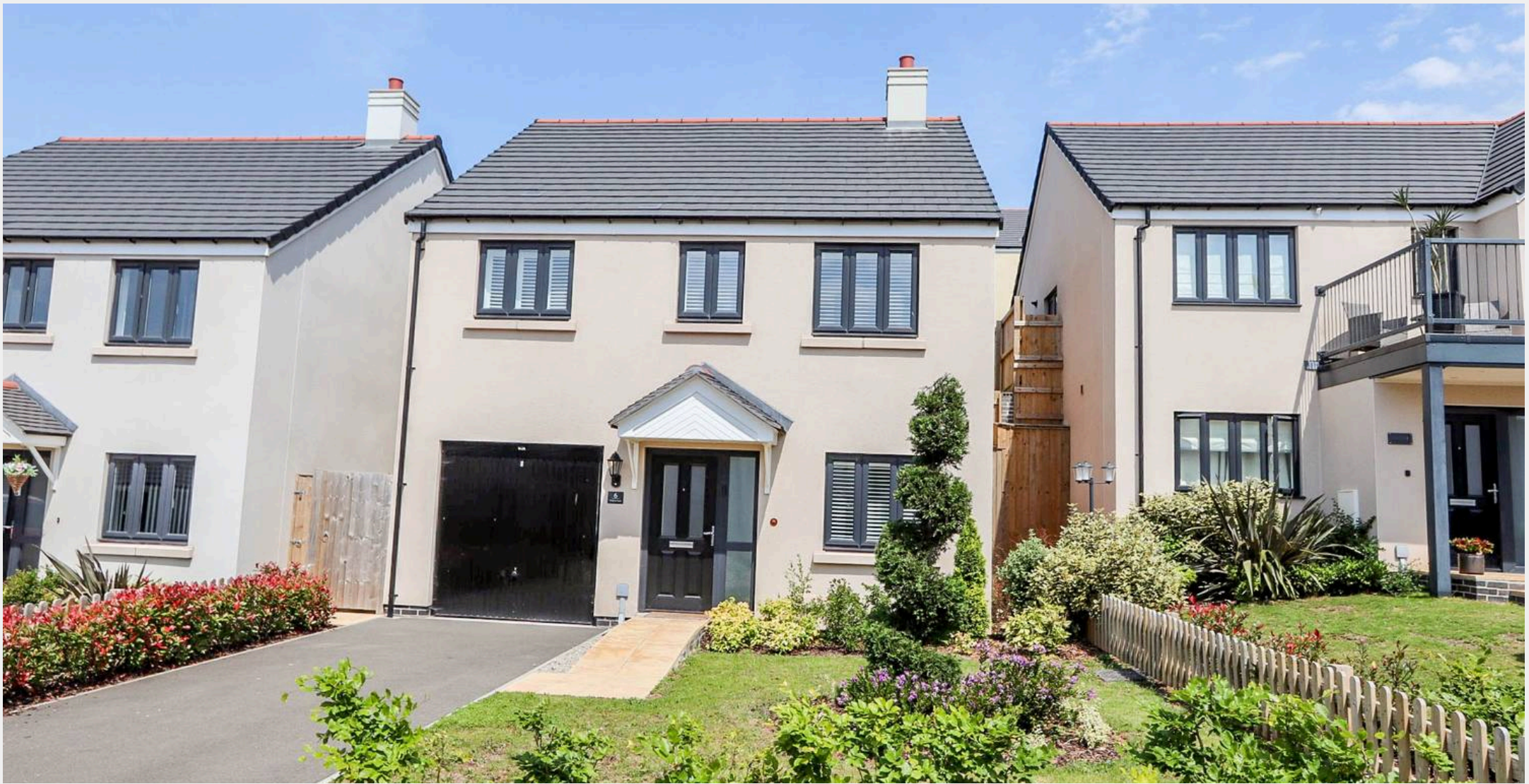
6 Foxglove Court, North Tawton North Tawton