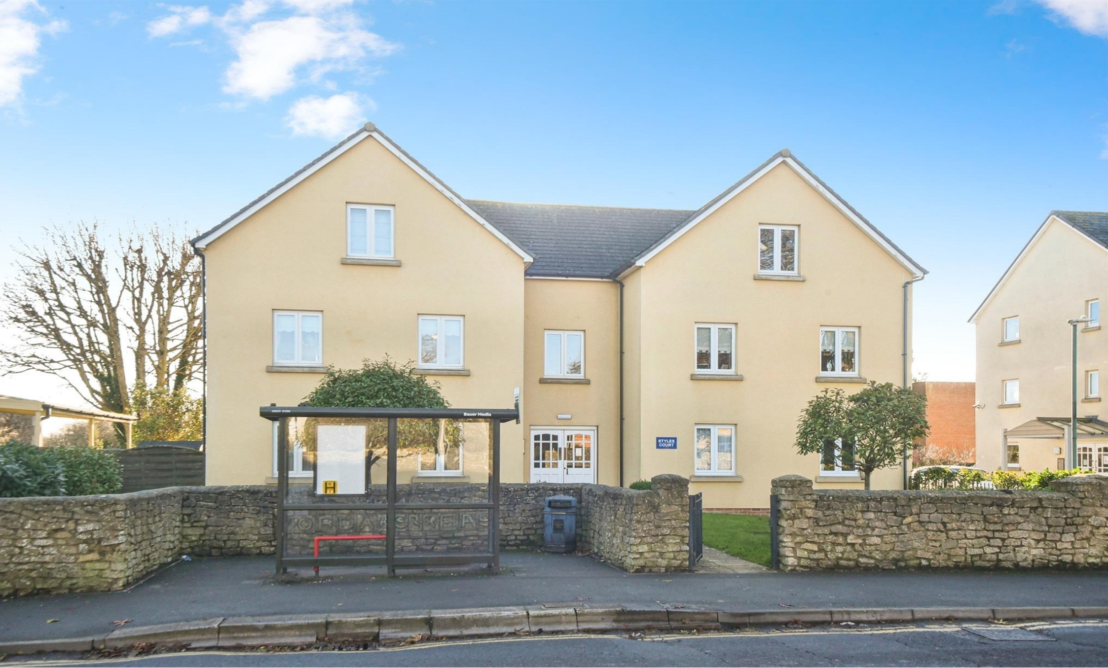
Styles Court Brewery Street, Highworth Swindon SN6 7AJ