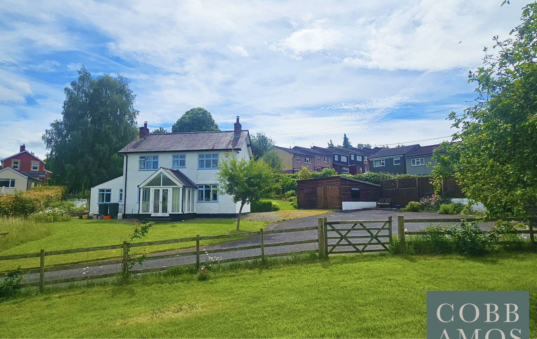
Oak Tree Cottage, Knucklas Road, Knighton, LD7 1UP Guide Price £500,000