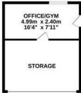
GROUND FLOOR 144.5 sq.m. (1555 sq.ft.) approx.