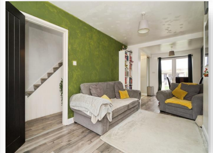
Clayton Drive, Thurnscoe ROTHERHAM S63 0RZ