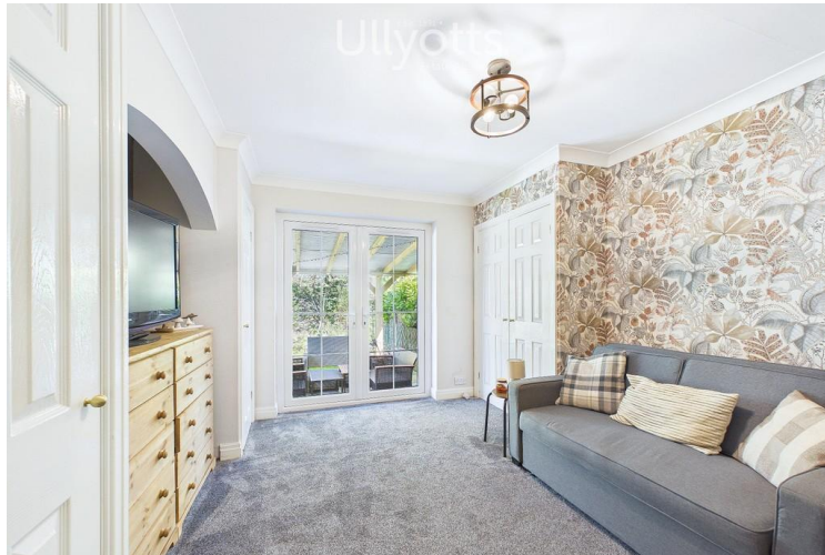
Bedroom / Reception