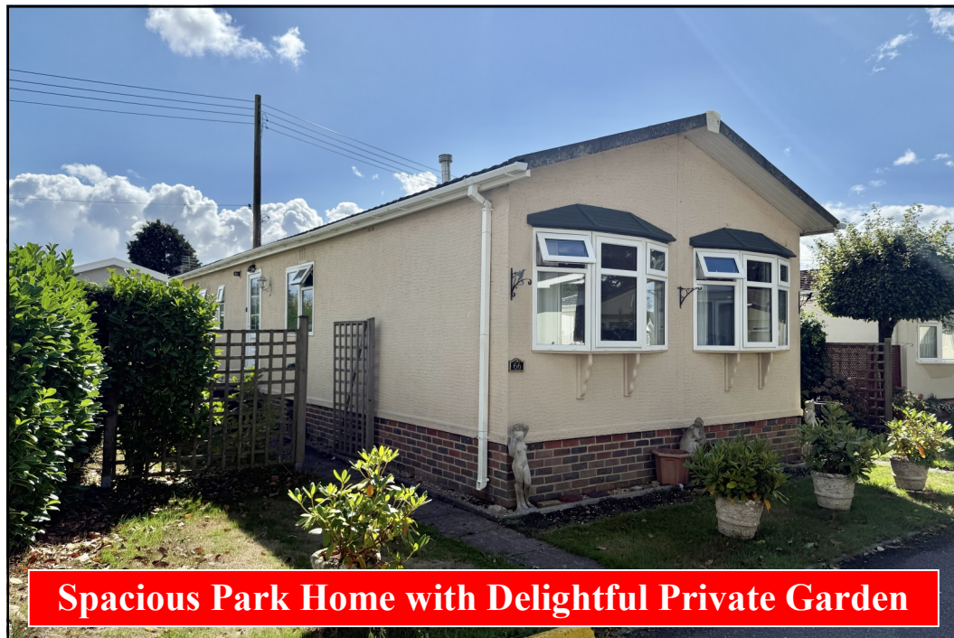
Spacious Park Home with Delightful Private Garden

66 St Leonards Farm Park, Ringwood Road, West Moors, Dorset. BH22 0AQ