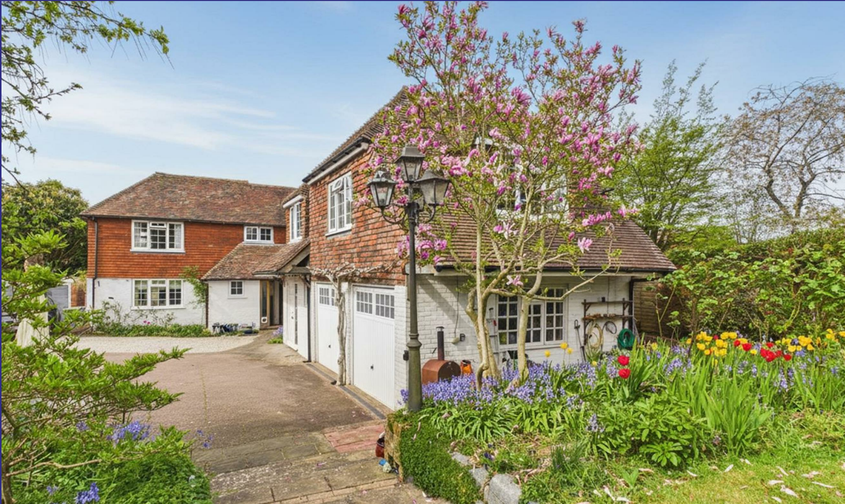
Upper Vicarage Road Kennington