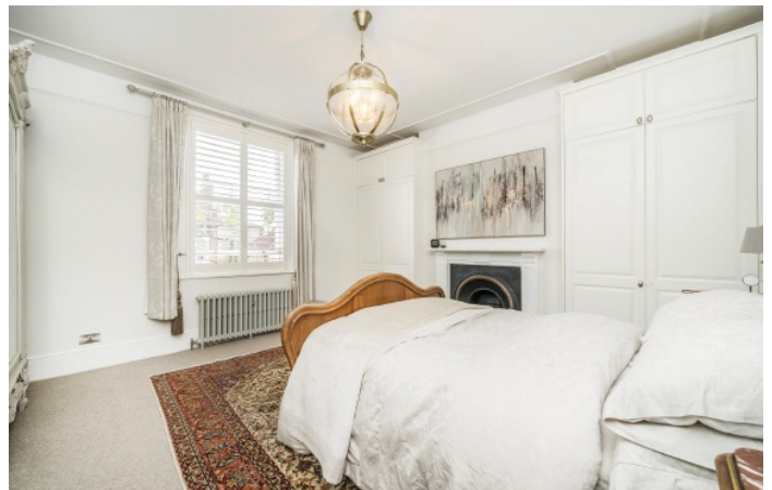
Cadogan Road, KT6