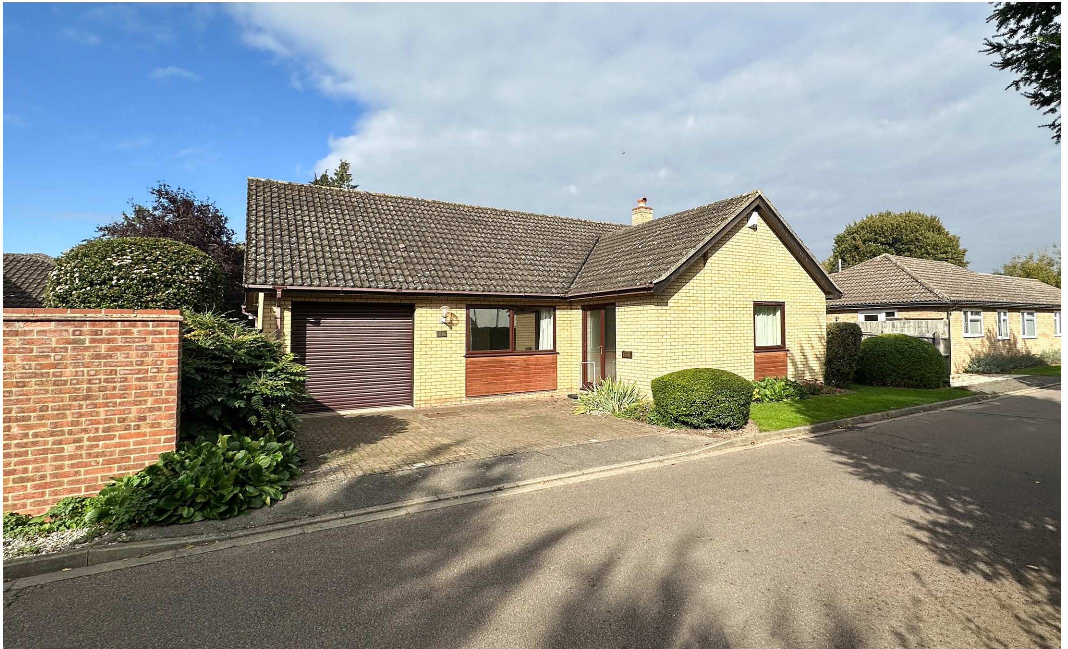
Murton Close, Burwell