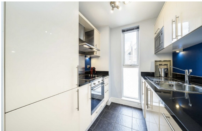
Great Suffolk Street, SE1