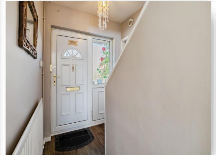
Gracedieu Road, Loughborough