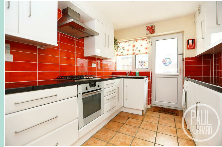
Leona Crescent Lowestoft, NR33 8JY