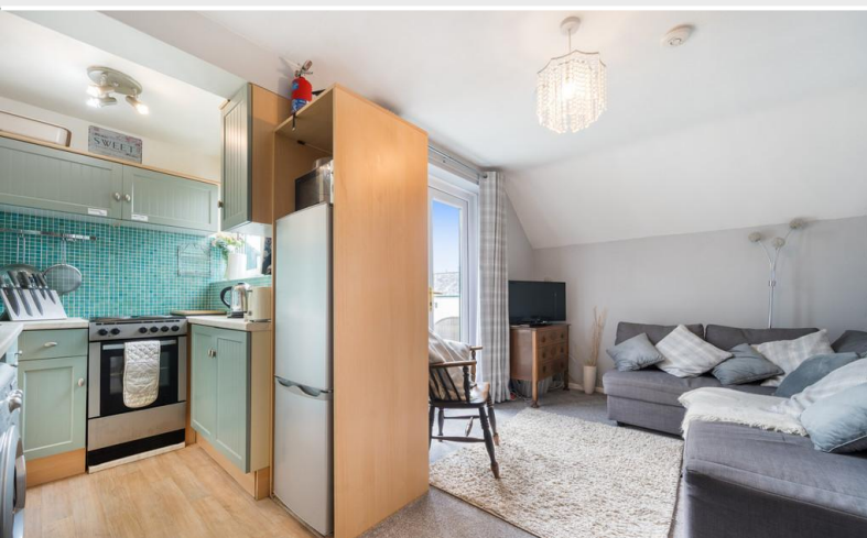
Open Plan Lounge/Kitchen