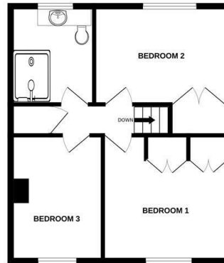
1ST FLOOR 485 sq.ft. (45.1 sq.m.) approx.