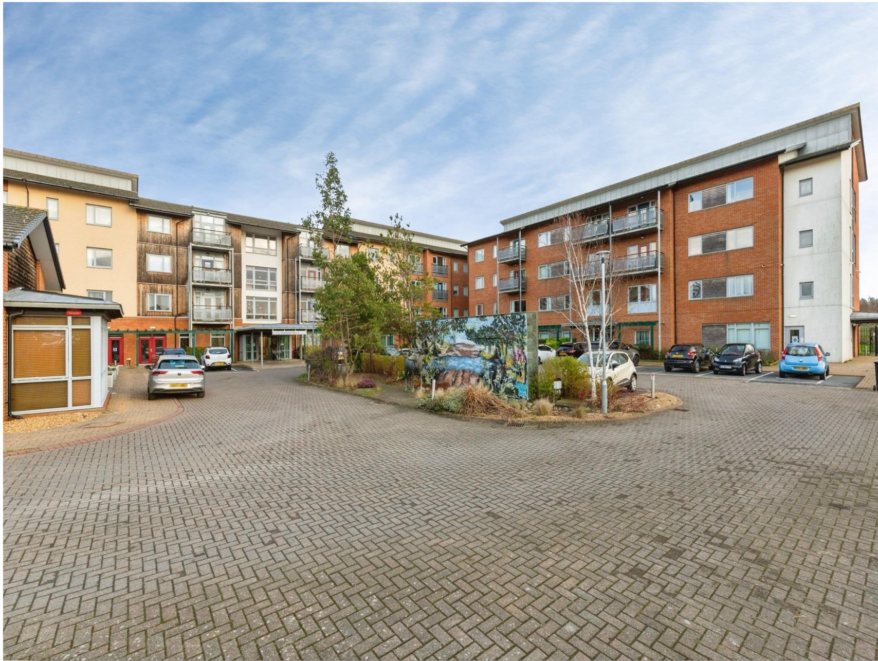
Hartfields, Hartlepool TS26 0US